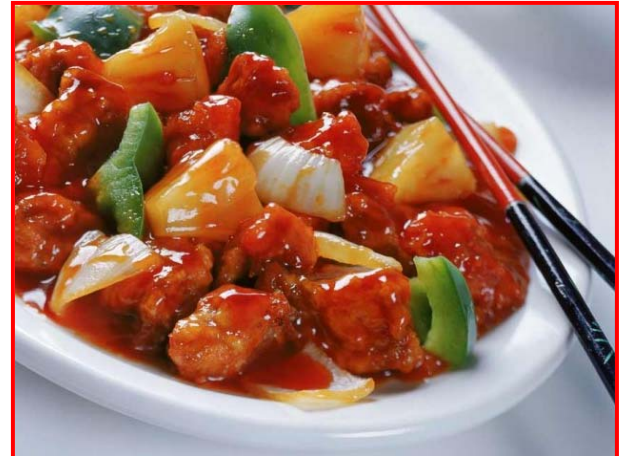
Battered Chicken & Cherry Blossom Sauce

*Actual Nutritional Facts may vary depending on preparation